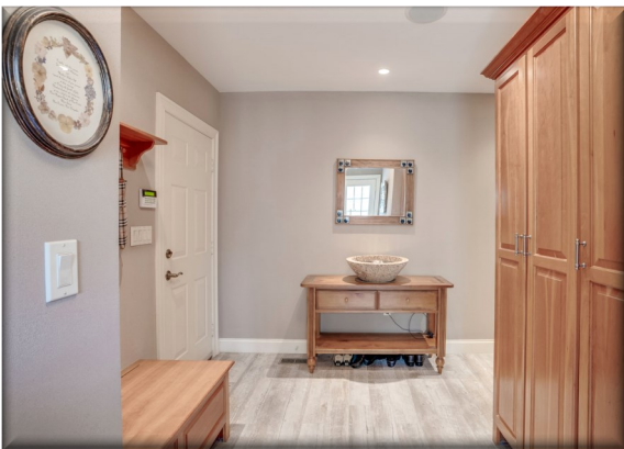
Mudroom: 12' 5" x 15' 9"