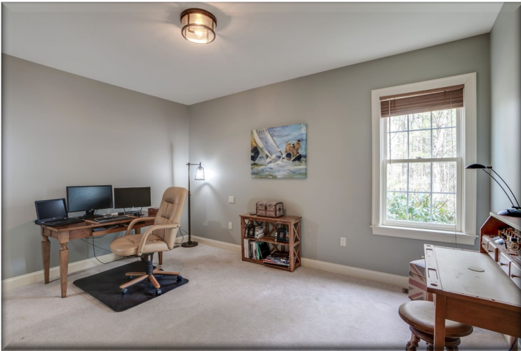
Bedroom or Office : 14' 10" x 11' 5"