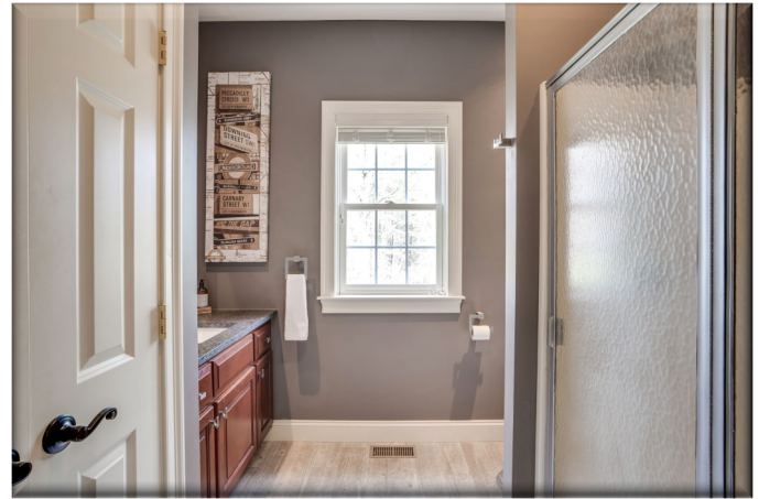
3/4 Bath: 8' 10" x 11' 4"