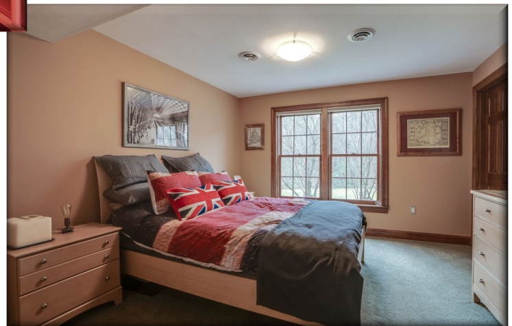
Bedroom: 13' 4" x 12'