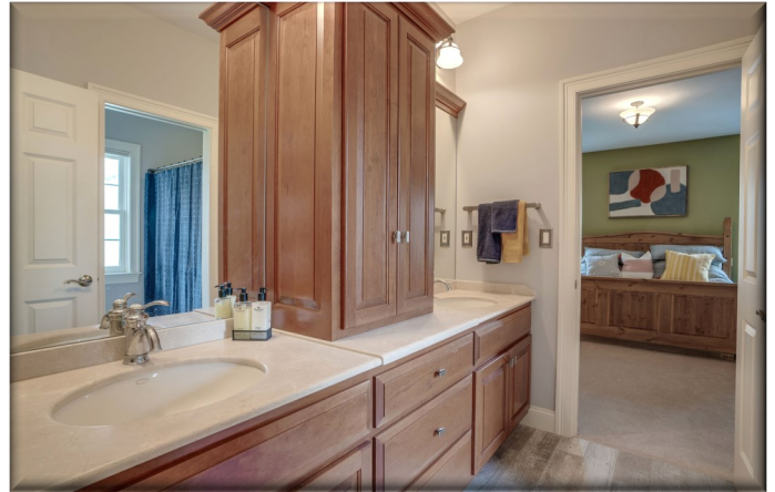
Shared Full Bathroom: 10' 10" x 8' 2"