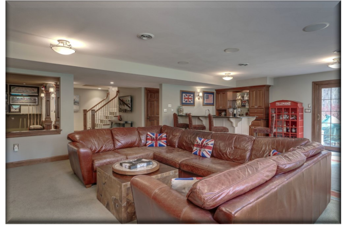
Rec Room: 29' 8" x 20' 9"