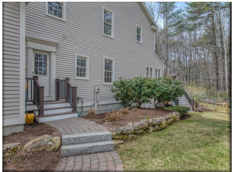
Side Entry from Garage