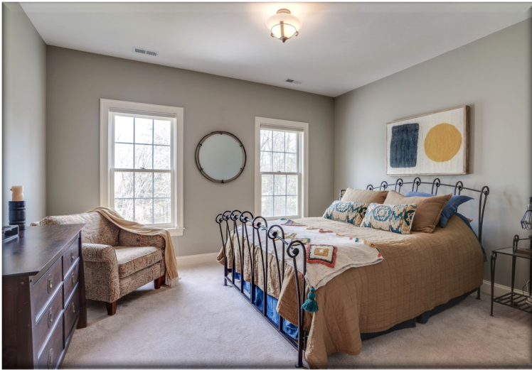
Bedroom with Shared Bath: 15' 7" x 13' 11"