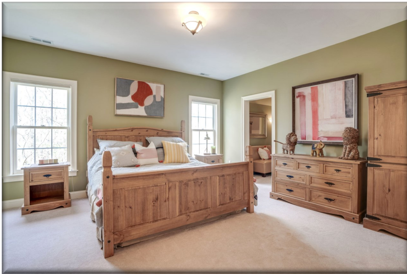
Bedroom with Shared Bath: 15' 6" x 18' 5"