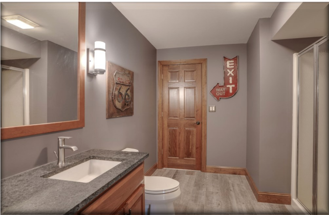
3/4 Bathroom: 9' 8" x 10' 3"