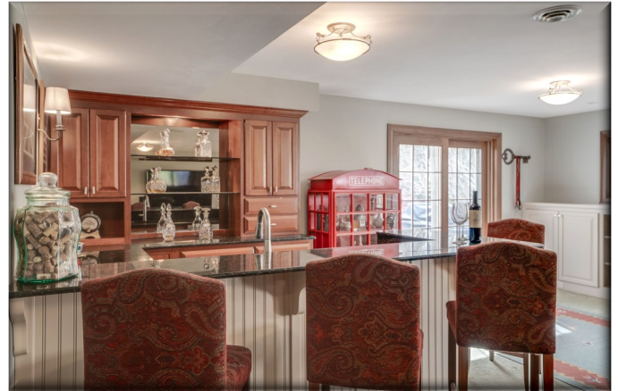
Bar: 7' 8" x 7' 2"